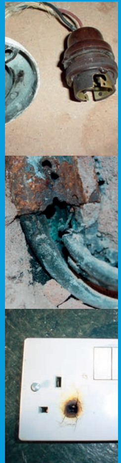
Typical examples of potentially dangerous electrical installations